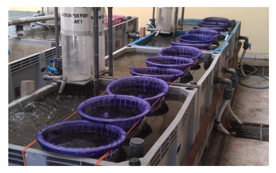
Figure 2. Section view of experimental design.

The results were analyzed using one-way analysis of variance with the aid of sigma stat software Version 3.5. The Fisher LSD test was used to further compare the mean differences.