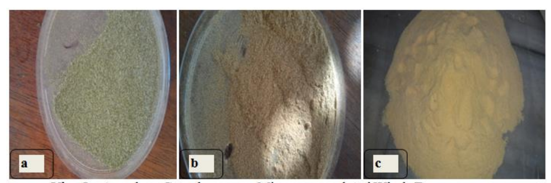
a. = Ulva Lactuca , b. = Grasshopper, c. Microencapsulated Whole Egg Figure 1. Powdered ingredients.

About 3600 fries of 4 days old of almost equal size (weight and length of 1.49 mg and 6.56 mm, respectively) were stocked in 24 plastic baskets (measuring 35 cm in diameter and 24 cm height wrapped with fine cloth mesh). Baskets were divided into eight experimental treatments: T1, T2, T3, T4, T5, T6, T<sub>7</sub> and T<sub>0</sub> each in triplicate and suspended on eight tanks with constantan circulation of water (Fig.2). Seven different powdered feed (namely: F1 = Ulva lactuca; F2 = Grasshopper; F<sub>3</sub>="Micro-encapsulating" whole egg; F<sub>4</sub> = F_1 + F_2 ; F_5 = F_1 + F_3 ; F_6 = F_2 + F_3 ; and F_7 = F_1 + F_2 + F_3 ) were prepared and fed the fry to the satiation in the respective experimental treatments against T<sub>0</sub> fed with Artemia (0.5 mm) as control. The mixed feed was prepared in an equal proportion of 1:1. The stage of